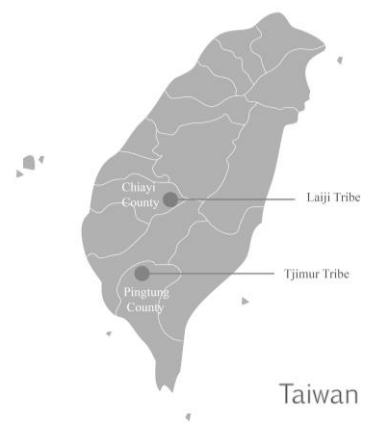
Figure 1 The Locations of the Laiji Tribe and the Tjimur Tribe

The history of the Tjimur touching the outside world was half a century. Earliest starting from the Japan Occupation Period, this area had developed its own industries of cultural tourism. Currently, it has become the political and cultural center of the Paiwan in the southern Taiwan. In view of the graphical site, it is also the center of the North Paiwan, a pivot of the political, societal, economic and cultural resources [5].